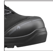
HAIX® Nano-Carbon Toe Cap