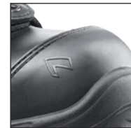
HAIX® Composite toe cap