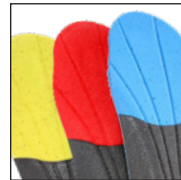
HAIX® Vario Wide Fit System