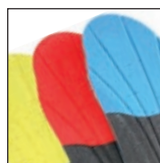
Vario Wide Fit System