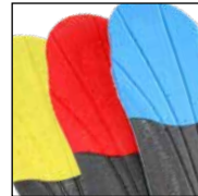
Vario Wide Fit System