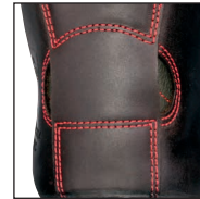
HAIX® FP System