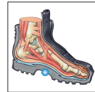
HAIX® AS System