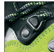
HAIX® 2-Zone Lacing