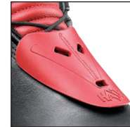
HAIX® 3Z Protector System