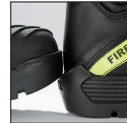
HAIX® ES Out System