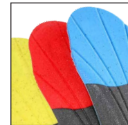
HAIX® Vario Wide Fit System