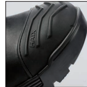
HAIX® HD Cap System