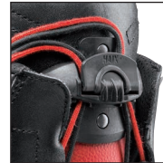
HAIX® FL Fit System