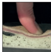
HAIX® MSL System